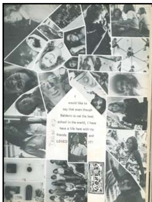
Class of 1975

In 1975, 22 Seniors graduated from Baldwin. This year, 51 Seniors graduated. A lot has changed since 1975, but it is great to see how far Baldwin has come and grown the last 40 years.