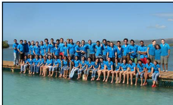
Class of 2008