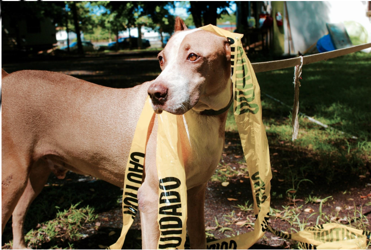
Rocco- I am approximately two years old. I am vaccinated and castrated. I am sociable, obedient y tranquil. I would love to be your new pet!