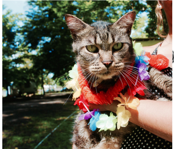
Yao- I've been waiting six years for a home, and I'm a bengal mix. I'm castrated and free of parasites. I'm also FLV and FIV negative. I'm sociable and kind!